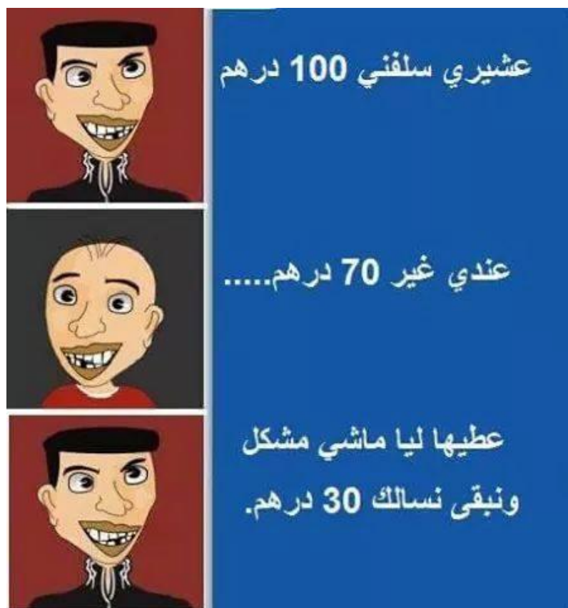
Figure 2. Ashābī face meme. Retrieved from: https://www.facebook.com/1377364855886852/photos/a

In Figure 2 above, we see the ashābī face (the image of a face with a tricky grin) that depicts a typical young Egyptian who wears European clothes but acts like an Arab. This meme expresses wiliness and gumption, and it is used in different Arab countries. The textual part of this joke is presented in the following dialogue in colloquial Arabic: