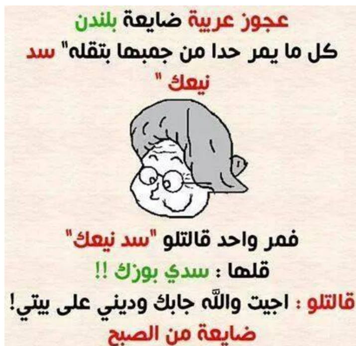
Figure 3. Meme about an old Arab woman. Retrieved from: https://www.facebook.com/pg/%D8%A3%D8%AC%D9%85%D8%AF-%D9%86%D9%83%D8%AA-%D8%B6%D8%AD%D9%83-%D9%84%D9%84%D8%B5%D8%A8%D8%AD-jokes-123311397169/photos/?ref=page_internal

grandchildren, to tell a witty story about a typical old Arab woman who can use coarse words (see Figure 3 below), to transmit a story about the wisdom of the older generation, or just for fun, etc.