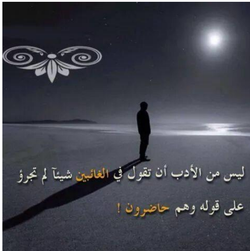
Figure 8. Creolized text with citation. Retrieved from: https://www.facebook.com/pg/hekmetalyom/photos/?ref=page_internal

the context of adjacent information that has a seemingly endless variability of rote information – governing one’s intimate and undivided attention from other graphics that may be more eye-pleasing.