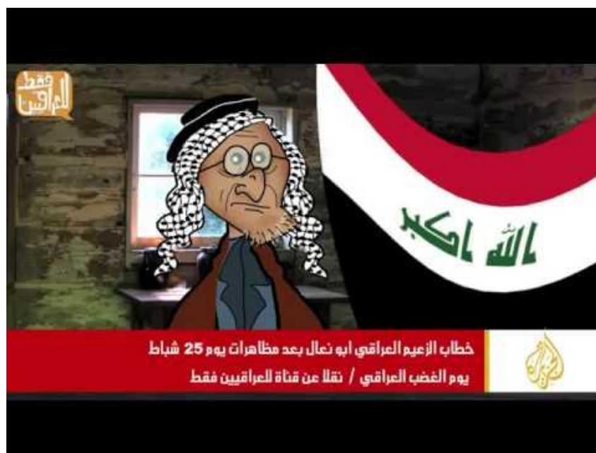
Figure 4. Abū na'āl meme.

While previously analyzed faces are common for the entire Arab world, the caricature face of abū na'āl , literally ‘Father of the slippers’, is exclusively Iraqi and it is intended to be adequately understood by Iraqis. This character had first appeared on YouTube. A group of teenagers had seen an old man in worn-down slippers at a market. They decided to make fun of him, but when they started, he answered them with coarse and obscene language. Since then, abū na'āl had become very popular among the Iraqi Internet users. They drew the caricature face of abū na'āl , and he became a national folkloric hero. This character had been used in many videos where abū na'āl posed as the president of Iraq (or the savior of Iraq), with the unique knowledge on how to lead the country to prosperity. In 2014, it was reported that more than 90 years old real abū na'āl had passed away, and since December 2014, we have not found any new folkloric materials about him.