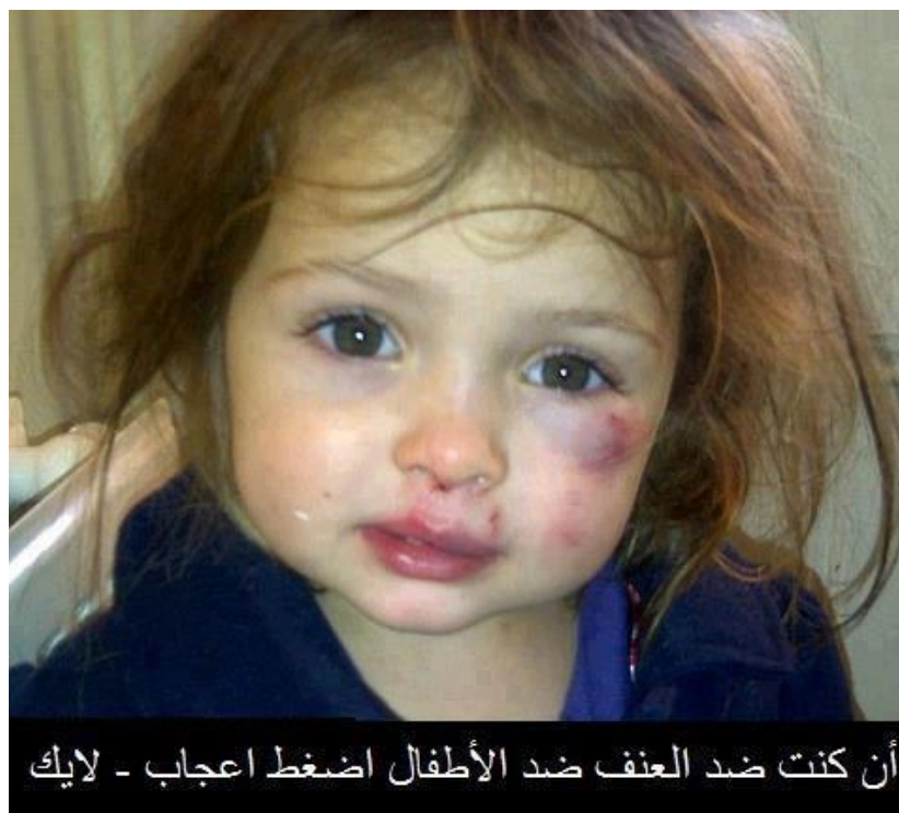
Figure 7. Chain meme against violence.

The phenomenon of quotes has become well-spread in Arabic postfolklore. The quotes can be taken either from ancient and modern literature or from the arsenal of contemporary folk culture creativity. The literary quotes consist of quotations from medieval and modern poetry, various novels, fairy tales both from Arabic heritage and world literature. The samples from traditional folklore are also cited in postfolklore. These can be fragments from folk stories, parables, and proverbs. The author can be omitted due to the socialization tendency of the postfolklore. Such quotes might be statements of famous personalities, not necessarily from literature, but also from philosophy, politics, psychology, etc. Thus, the quotes of Aristotle, Plato, S. Freud, and others are constantly posted, shared and discussed in the social networking.