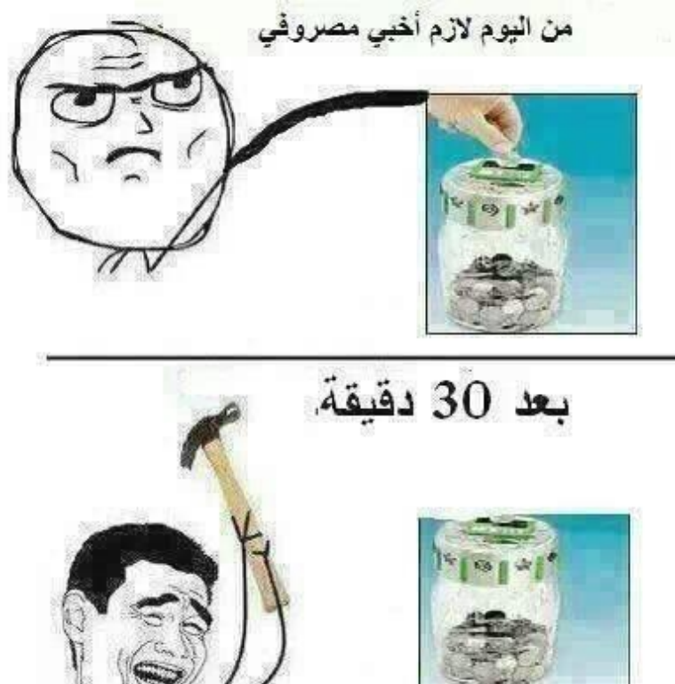
Figure 1. Borrowed frame and faces of the Rage Comics.

The first part of the Internet-meme in Figure 1 above represents a caricature face with purposeful expression stating: ' I need to save money as of today '. The second part of this meme depicts the laughing Yao Ming Face that breaks the money jar only thirty minutes after the initial statement. This meme refers to a daily situation. It provides concise phrases that are inherent for the oral discourse. Although the word ' lāzim ' ('needed') exists in a literary variant of the language, it is predominantly used in Colloquial Arabic. The incomplete sentence ' ba'da 30 daqīqa ' (in 30 minutes) serves as an example of intrapersonal communication. Such a spontaneous phrase demonstrates rather one's thoughts than their verbal expression in the conversation. Together with the iconic component, this text helps the recipients envision and understand the reported event.