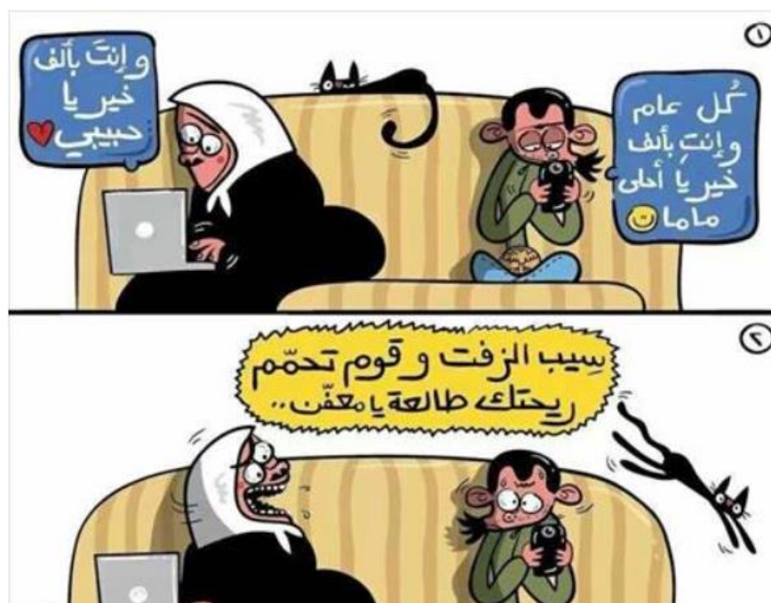
Figure 5. Arabic meme about family relationships.

The font type and size are mostly preserved the same within the entire series of these memes, while the color may vary within a single sample. These memes show the tendency for expressing the folk creativity in the Arab web. Other less often used characters are the Arab woman, with coarse facial features, hijab, and the same frustration, as well as the cat, which is depicted as indifferent, sleeping and pacified, or frustrated.